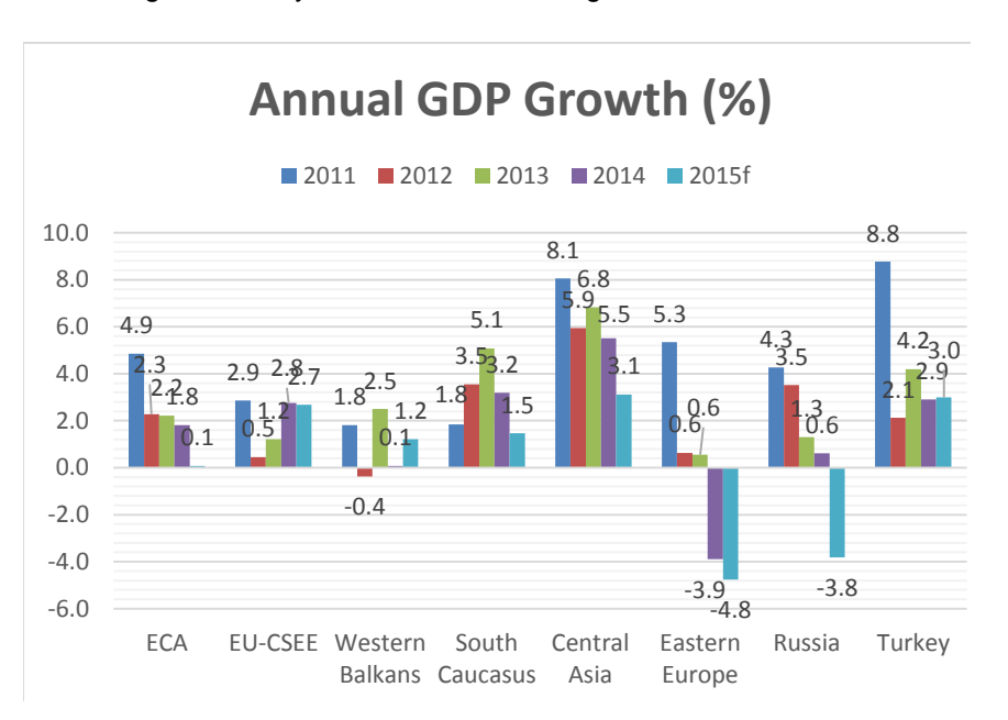
Note: W. Balkans (Albania, Bosnia & Herzegovina, Kosovo, FYR Macedonia, Montenegro, Serbia); EU-CSEE (Bulgaria, Croatia, Czech Republic, Hungary, Poland, Romania, Slovak Republic, Slovenia); E.Europe (Belarus, Moldova, Ukraine), S. Caucasus (Armenia, Azerbaijan, Georgia), Central Asia (Kazakhstan, Kyrgyz Republic, Tajikistan, Turkmenistan, Uzbekistan)

Countries highly dependent on oil exports, or on trade and remittances from oil exporting countries, are showing signs of a sharp slowdown, compounded by ongoing geopolitical tensions due to the conflict in Ukraine. However, EU-Central and South Eastern Europe (EU-CSEE) and the Western Balkans are seeing initial signs of recovery with an increased pickup in net exports as the Eurozone is experiencing a nascent recovery with expansionary monetary policy and declining oil prices serving to boost consumer and business